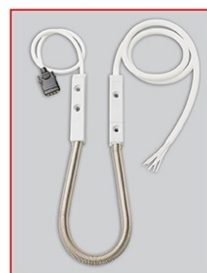
M 13 40

Variant M 13 40 is the perfect solution for an alarm glass connection, for example in patio doors. M 13 55 features a carrier box for the springs, with a circuit board with screw terminals attached to the rear. A range of components can be connected to this, depending on customer's requirements. These boxes are pre-installed during production of the window or door. All that remains to do is to connect the appropriate cables on site.