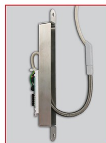
M 13 55

A range of accessories is also available for all miniature door loops from LINK. These include cover plates for wooden and plastic/aluminium frames. Carrier boxes for the springs are also available separately.