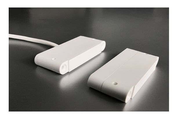
EKOM 22 contactless electronic transmitter

M 13 35 miniature door loop for concealed installation